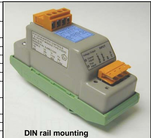
DIN rail mounting