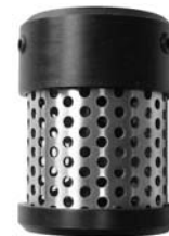
Optional Weatherguard (may not be suitable for use with absorbent gases)

Versions available for the detection of:-